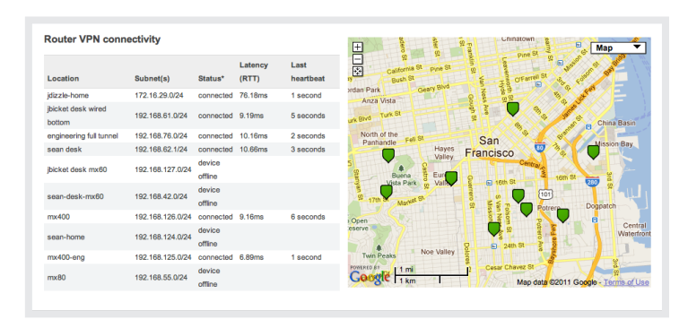
AUTO CONFIGURING SITE-TO-SITE VPN